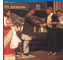
Receiving Award from Nepalese Prime Minister