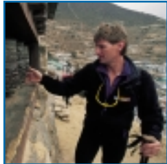
The trek to Everest Basecamp