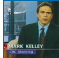
Mark Kelley interview on CBC Morning