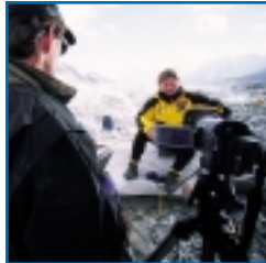
CBC Live Television Broadcast from Everest