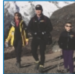
Husband and Father