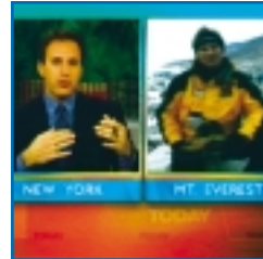
Matt Lauer interview on NBC Today